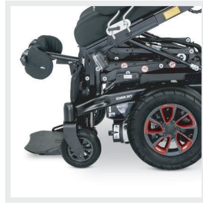
Direct Transfer Aid- Height adjustable footboard, for easy transfer with pressure relief