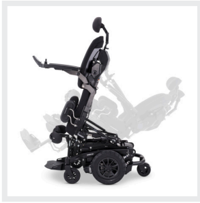
Stand up to 90° – make socialising easier, reduce risk of respiratory complications