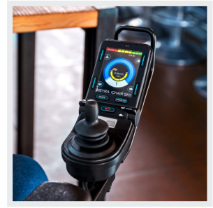
Chair position memory function – find your comfort zone & save it